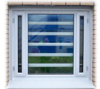
horizontal bars (Scottish)