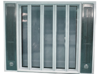
vertical bars (English)