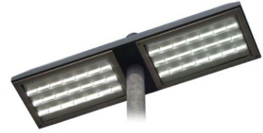
Twin Unit Perimeter Light