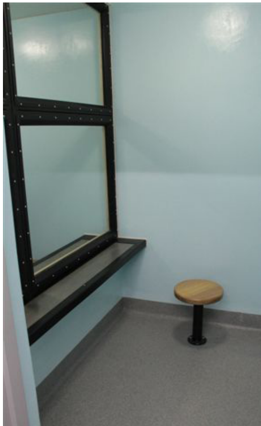
CSL0538 - Timber Stool