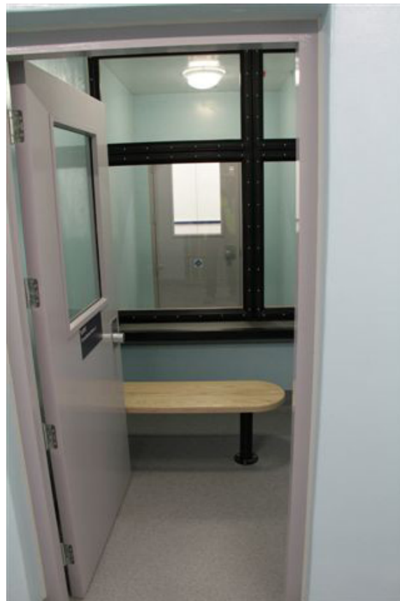
CSL0542 - Timber Island Seat