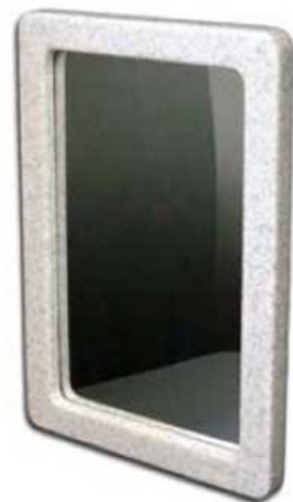
CSL1112S (small) 250mm x 350mm