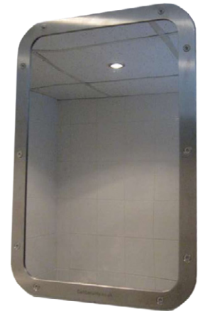
CSL1211S (small) 200mm x 260mm