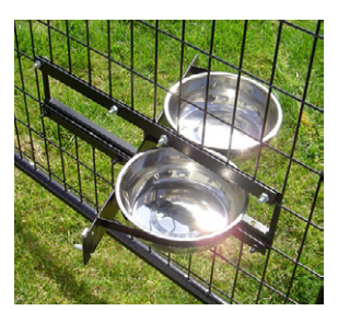
Optional revolving dog bowl system