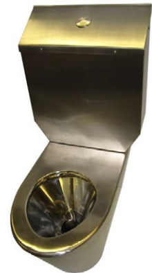
CSL0907E Electrical Operation