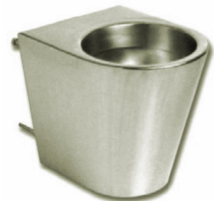
CSL0908H Horizontal Standard