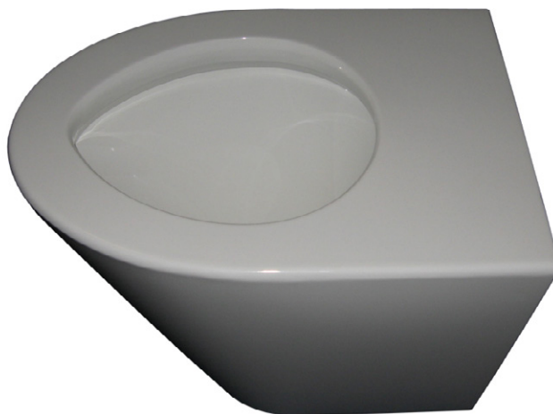
CSL0901 - Stainless Steel Horizontal WC Pan Stove Enamelled