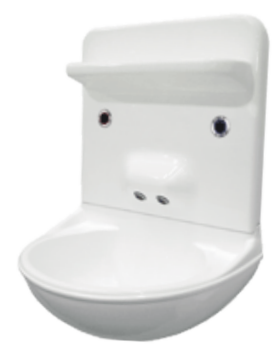
CSL0964B Washbasin With Shelf