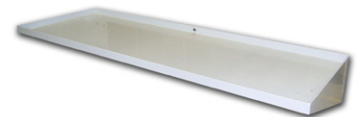
CSL0508A - Single CSL0508B - Double with ladder